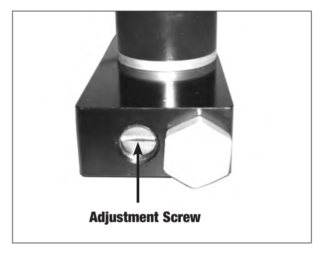
Figure 3 - Fuel Pressure Adjustment